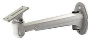
Indoor/outdoor wall mount DS-1213ZJ