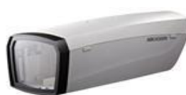
Indoor camera housing DS-1320HZ