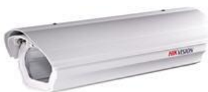
Indoor/outdoor camera housing DS-1311HZ (DS-1312HZ, DS-1313HZ)