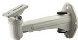
Indoor wall mount DS-1212ZJ